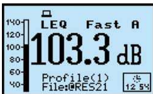
Main result in one profile view

**with USB 1.1 Host function not active and backlight off